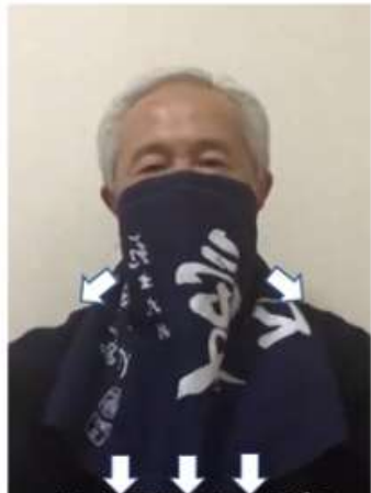
Air escapes downwards and sideways